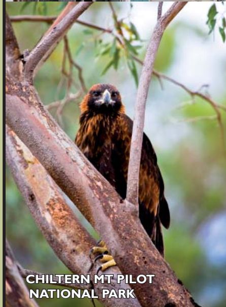
CHILTERN MT PILOT NATIONAL PARK