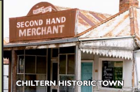
CHILTERN HISTORIC TOWN