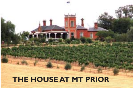
THE HOUSE AT MT PRIOR