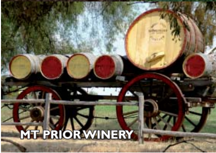
MT PRIOR WINERY