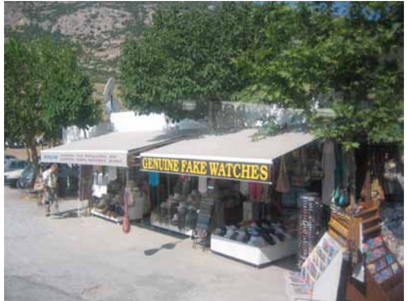
at a tourist stop near Ephesus, on the west coast of Turkey.