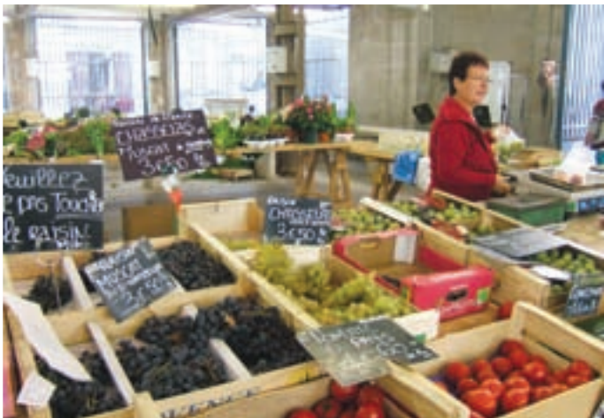
Look closely and you may find some familiar names in this charming Friday market stall in St Malo, France

Suddenly there is a blinding flash of light as the heavens open. The blonde is overwhelmed by the voice of God Himself, 'Sweetheart, work with me on this - buy a ticket!'