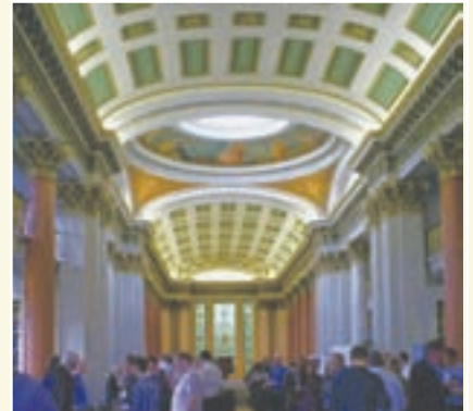
The magnificent ceiling in the Signet Library Edinburgh, Scotland the venue for Enotria's first New World Roadshow series of tastings. This is the home of the Society of Writers to Her Majesty Queen Elizabeth's Signet independent lawyers association of Scotland.

We are expecting an influx of visitors at our cellar door as work on the nearby Rail Trail is almost complete. The track, runs along the old railway line between Rutherglen and the banks of the Murray River at Wahgunyah, cutting across Barkly Street only about 50 metres away from us. Please don't forget to pop in if you need a breather - we've always got plenty of rain water and a cool spot to sit and relax.